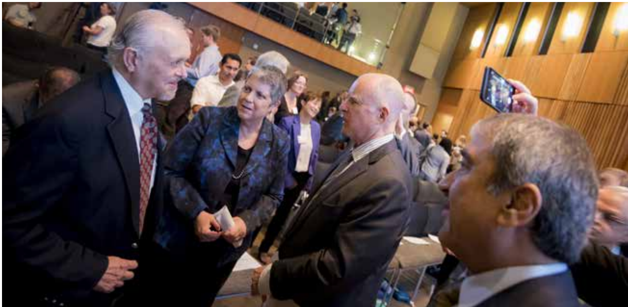
Nobel Laureate and Distinguished Professor Mario Molina, UC President Janet Napolitano, California Governor Jerry Brown and UCSD Chancellor Pradeep Khosla attend the carbon neutrality summit.