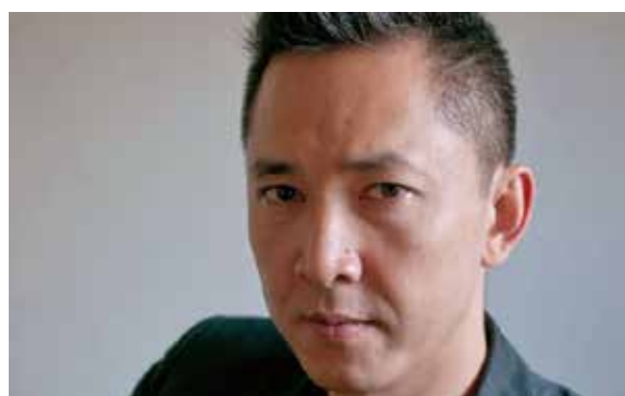
Pulitzer Prize Winner: UC Berkeley's Viet Thanh Nguyen (English Ph.D. and English @ ethnic studies, BA) won for his debut novel, "The Sympathizer," a darkly humorous thriller about a double-agent living in California after the Vietnam War.